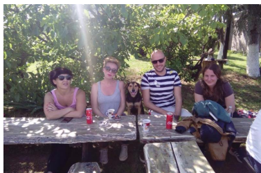
NLS Serbia: Annual Trip to Vojvodina