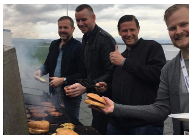
NLS Island: OPAP Teambuilding Party