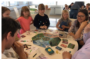
NLS Island: Family Game/Pizza Night