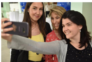
NLS Serbia: Celebrating 5th Anniversary