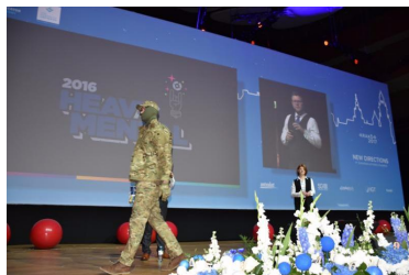
NLS: the 9th EL Congress in Krakow