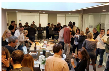
NLS Spain: Celebrating 1st Anniversary