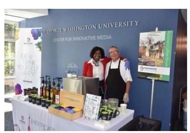
NLS at La Fleur D.C, Symposium