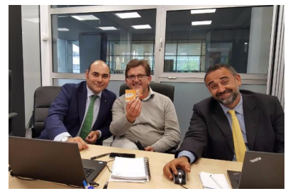
Our Collegues in Spain Celebrated the Launch of the La Grossa Raffle Tickets